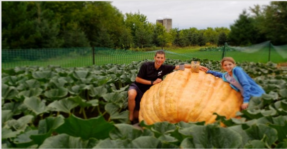
One of the top 10 pumpkins in their backyard